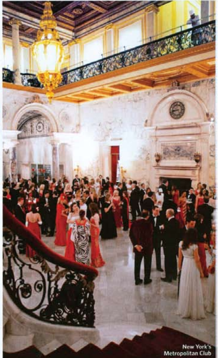
New York's Metropolitan Club