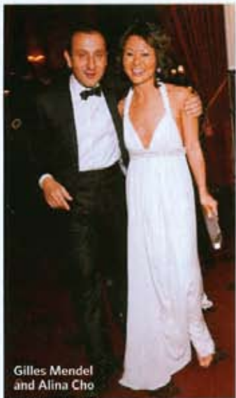
Gilles Mendel and Alina Cho