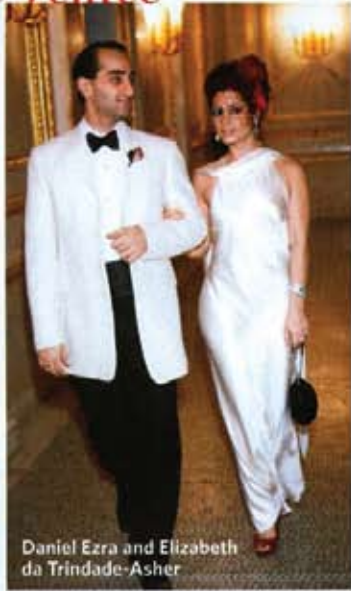
Daniel Ezra and Elizabeth da Trindade-Asher